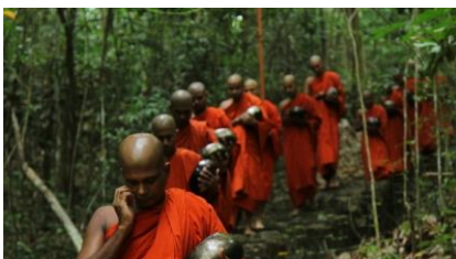
Buddhist Monks in a forest

With the Faith for Earth Strategy (2018), UNEP has adopted an integrated approach for the partnership with faith-based organizations. By cooperating with faith-based organizations, religious and cultural values become part of UNEP’s efforts towards achieving the Sustainable Development Goals (SDGs) of the Agenda 2030. Such partnerships shall enable inclusive, green and transformative development through adopting lifestyles and behavioral changes that are informed by faith-based and spiritual values. The integrated approach respects cultural diversity and religious, cultural and indigenous knowledge, and acknowledges and appreciates the value of faith when it comes to live in respect with planet earth. Coupling and informing strategies towards achieving the SDGs with faith-based approaches and values such as environmental stewardship or duty of care is the cornerstone for a common vision that focuses on valuing the needs of planet Earth.