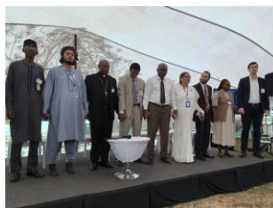
Representatives of different faiths at a parallel event as part of the Faith for Earth Initiative at the UN Environment Assembly