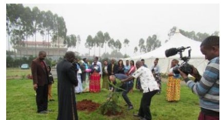
Tree planting at Ongata Rongai Church near Nairobi, Kenya